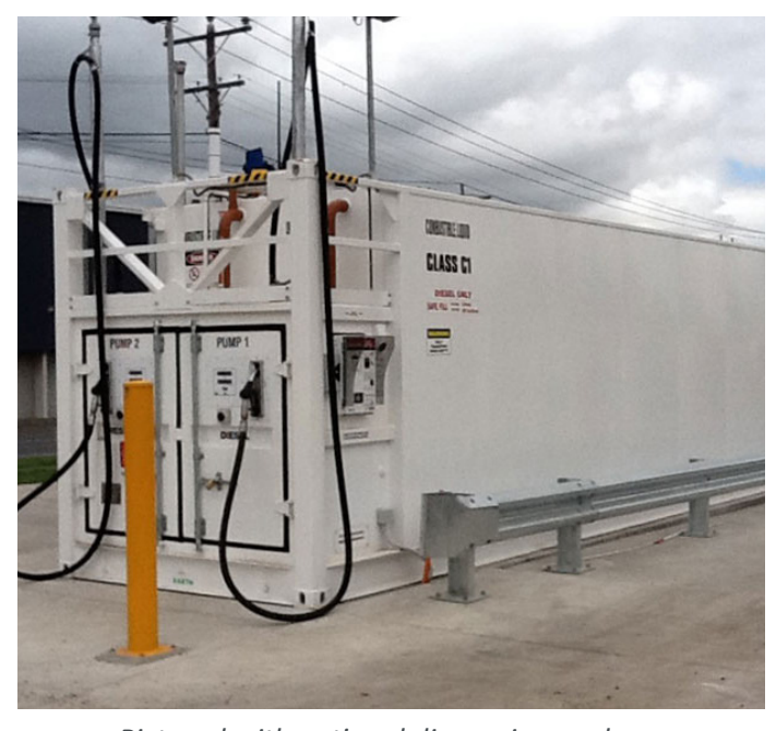
Pictured with optional dispensing package

A self bunded and transportable KLASSIC tank for the safe storage and handling of diesel and oils. Ideal for refuelling vehicles, machinery, equipment and fleet.