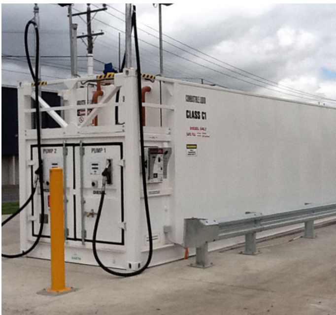
Pictured with optional dispensing package

A self banded and transportable KLASSIC tank for the safe storage and handling of diesel and oils. Ideal for refuelling vehicles, machinery, equipment and fleet.